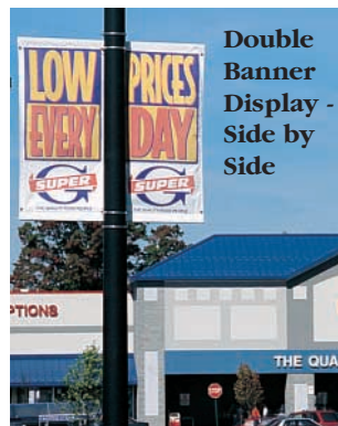
Double Banner Display - Side by Side