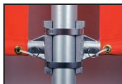
Double Aluminum Bracket

Note: For your Custom-made Avenue/Street Banner, please contact our Custom-made Quotation Department.