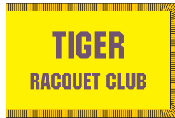
CLASS A Simple, one color background with letters only.

Prices shown are for images produced from digital graphic files, vector formatted. Other types of artwork such as black and white composites, photographs or scanned e-mail artwork can be accepted with additional art charges. The art charges are billed at $75.00 per hour and will be determined on a per order basis.