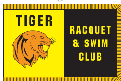
CLASS D Two color background, multi-colored silhouette with stitching detail. Up to 24 letters.