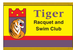
CLASS F Multicolored emblem, extensive detail and lettering.