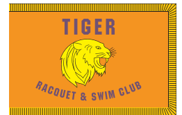
CLASS C One color background and silhouette with stitching detail. Up to 24 letters, block fonts.