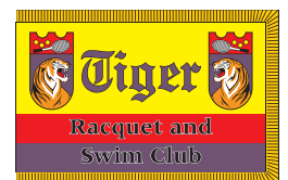
CLASS G Multiple emblems, color and details, extensive lettering.