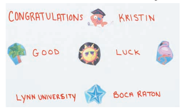
Original artwork supplied by customer